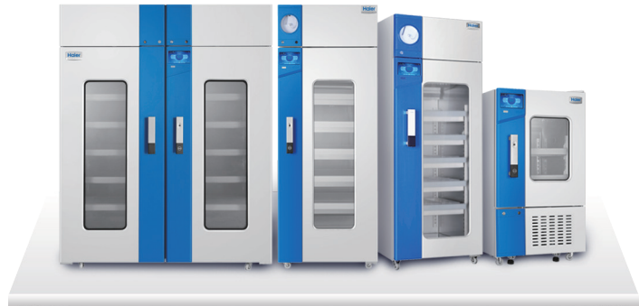
HXC-1369T HXC-629T HXC-429T HXC-149T

Real-time control and monitoring of blood information in the cabinet is possible via built-in smart blood management APP and cloud network connection. Blood product information and temperature are available in large LCD display.